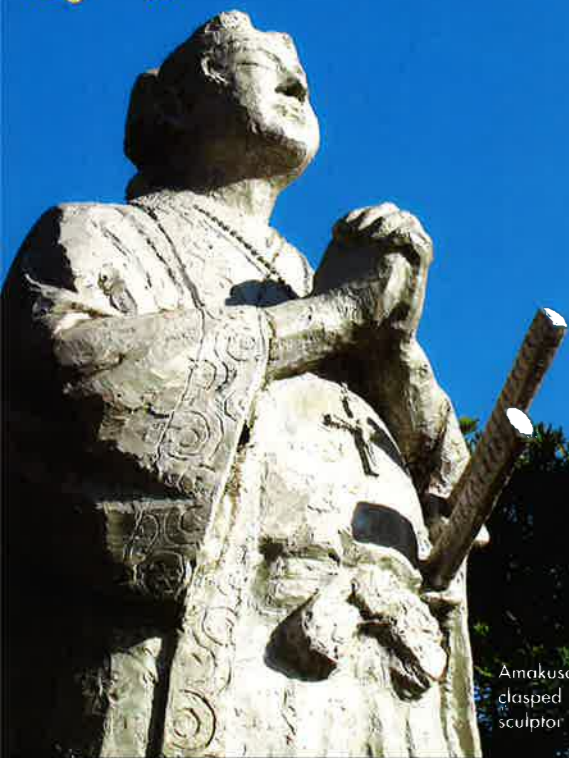
Amakusa Shiro with his hands clasped in prayer, created by sculptor Kitamura Seibo.

A World Heritage registration candidate tour site